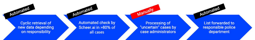
Plausibility check process in the future

This is exactly where the solution comes in. In future, only those cases that need to be corrected will be returned to the original reporting officer for checking; all others where a clear allocation can be made by the AI will no longer be checked manually. The process is now to be automated and the plausibility of the data ensured with the aid of artificial Intelligence. The latest technologies from the field of natural language processing are used to interpret the technical language of the accident reports and to allocate them to the relevant categories.